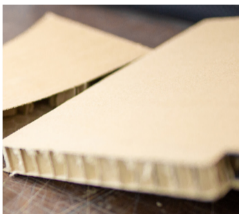
CARDBOARD HONEYCOMB PANEL NATURAL