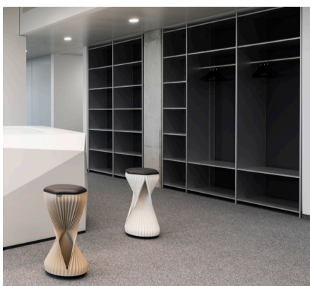
PROJECT Walter Innovationsbogen, Augsburg

For us, "bespoke interior system" means designing and planning spaces made to measure individually according to customer requirements, and planning to move organizations forward.