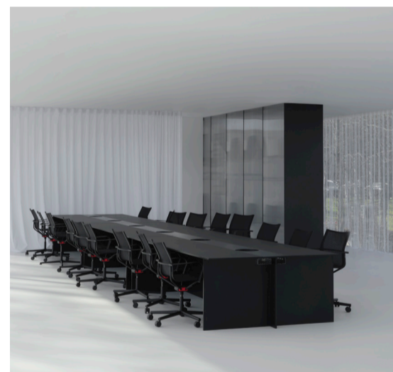
PROJECT #wagnerdesignlab, Langenneufnach