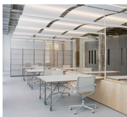
PROJECT Ramboll, Berlin