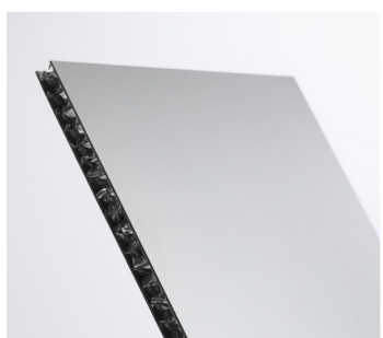
ALUMINUM HONEYCOMB PANEL